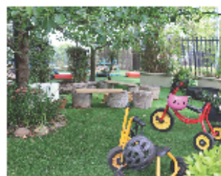
A large and engaging outdoor area