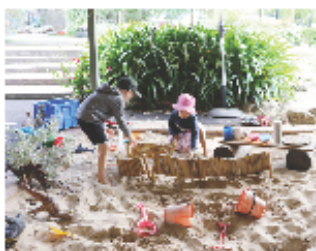
A focus on environmental sustainability