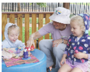
Qualified, caring and experienced educators