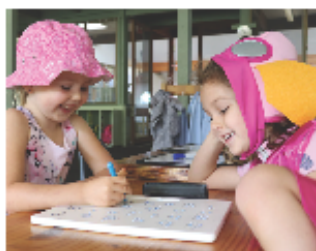
A full transition to school program