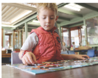
An educational, play-based curriculum

KU Galston provides high quality, not for profit early education for children aged 3 to 5 years, including: