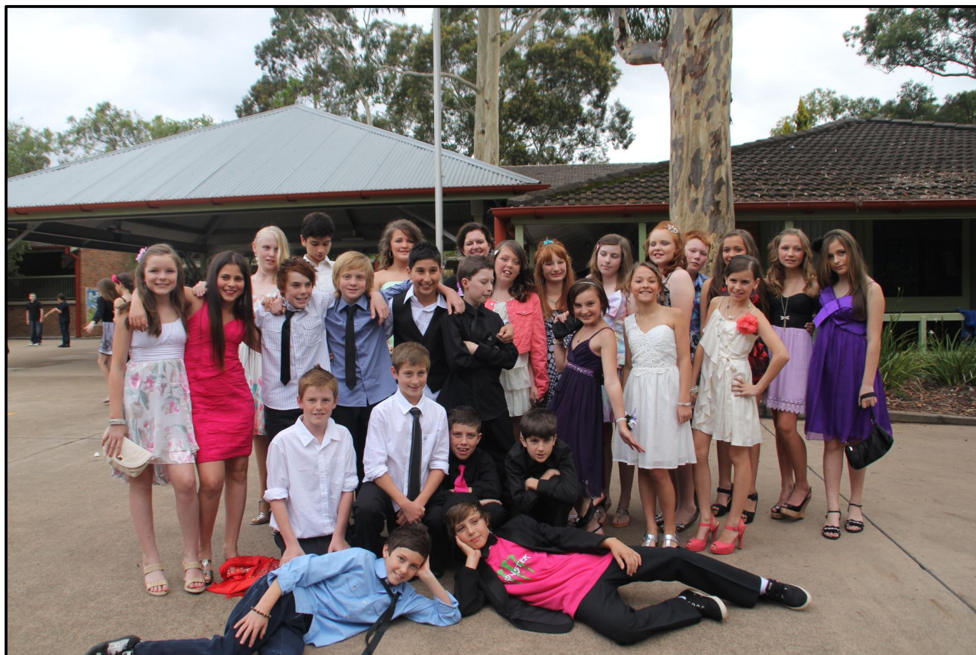
Farewell Year 6 - what a wonderful night! Wishing you all the very best for high school