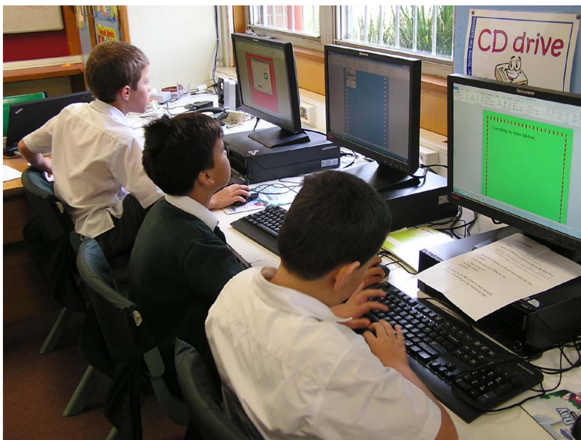
Students working on their E Book Work