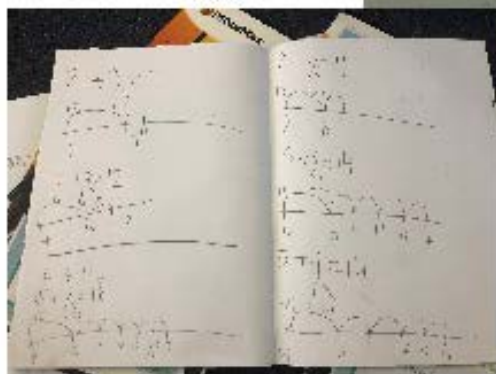
Great work, Abigail!