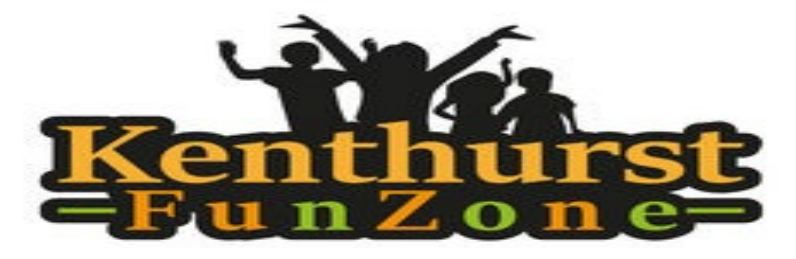
Term 1 Week 10